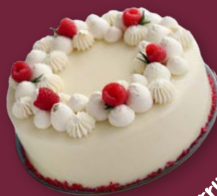
Fine raspberry tart with white mousse