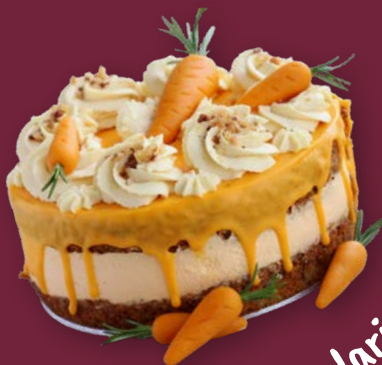
Carrot and mandarin slices