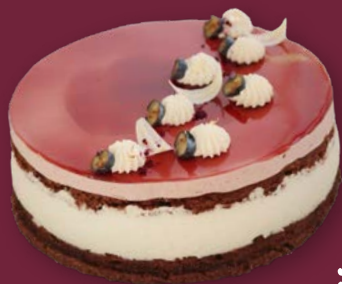
Cassis tart with crispy base